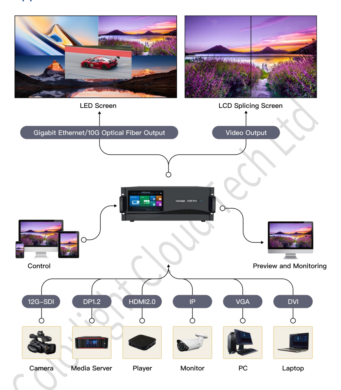
Note: The image shown is for illustration purpose only. Please refer to the actual product.